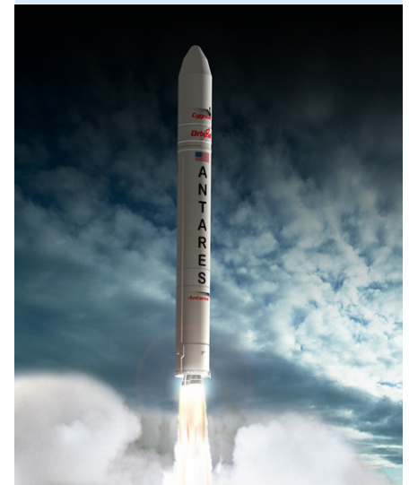
Artist's rendering of Orbital's Antares medium-class space launch vehicle