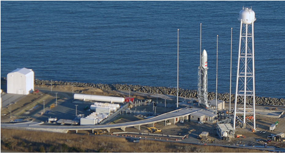
Antares will launch from the newly built Pad-0A at Wallops Flight Facility, Virginia