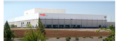
The C/NOFS spacecraft was designed, built, and tested at Orbital's 135,000 square foot satellite manufacturing and test facility in Gilbert, AZ

USAF SMC Defense Weather Systems Directorate, LAAFB, CA