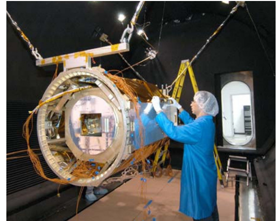
C/NOFS being readied for thermal vacuum testing at Orbital