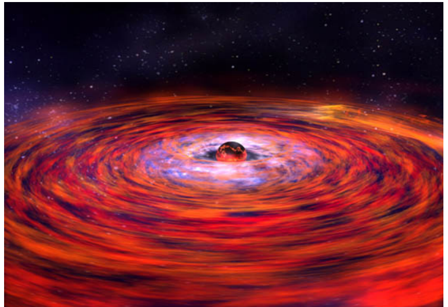
Artist's depiction of x-ray-emitting matter trapped near a black hole. Credit: NASA