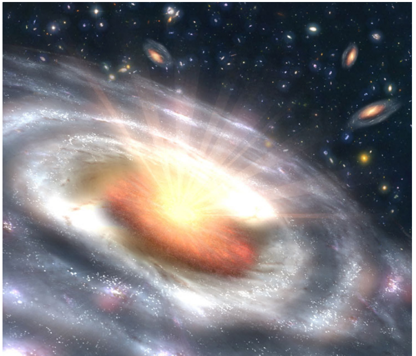
A growing black hole, called a quasar, can be seen at the center of a faraway galaxy in this artist's concept

Spacecraft Bus Development, Satellite Integration and Testing