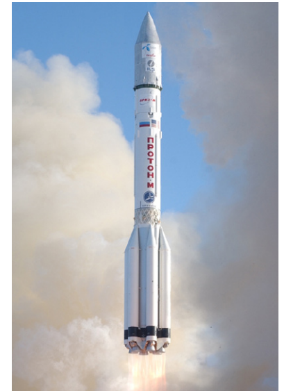
THOR 5 was launched into orbit on a Proton launch vehicle