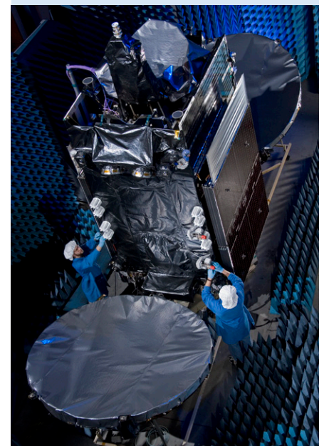
Thaicom 6 is based on Orbital's GeoStar-2 satellite platform, and will undergo integration and testing at Orbital's Satellite Manufacturing Facility in Dulles, VA

Customer: Thaicom Public Limited Company